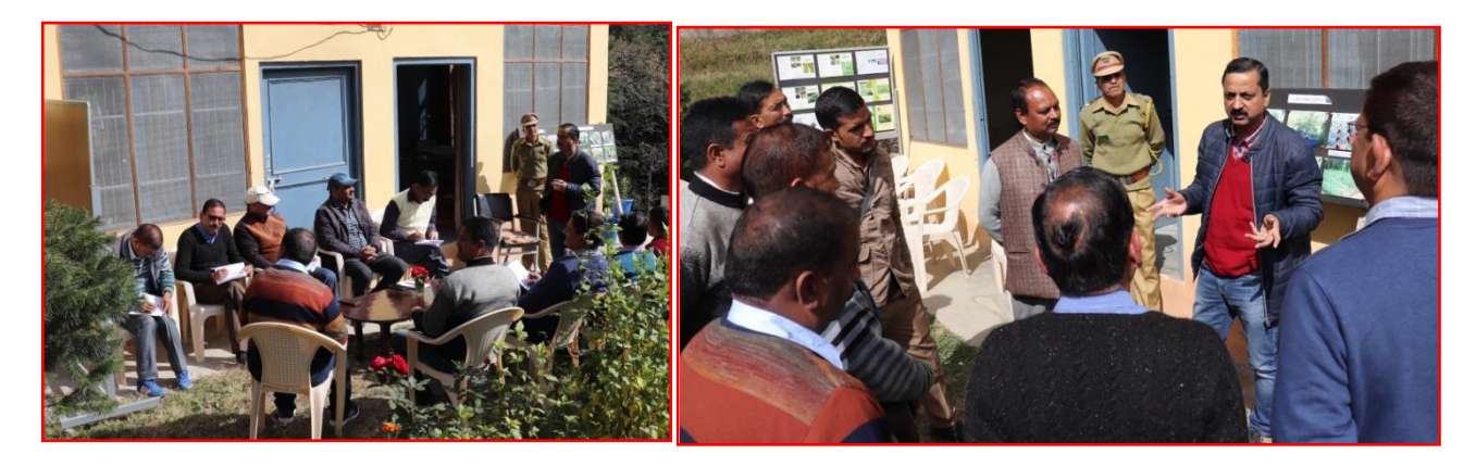
Field Visit to Shillaru nursery and interaction with the officials of HPSFD

The officials were taken for field visit to Kufri and Shillaru Research Nursery of HFRI where the trainees interacted with the officials of Himachal Pradesh Forest Department. The trainees were also taken to the alpine pasture at Hattu and were introduced to various medicinal plants on the way. They also visited Indian Institute of Advanced Studies, Deodar forests in Shimla town for Field demonstration of GPS applications and different research laboratories at HFRI.